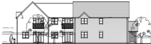
ELEVATION TO THE SOUTH