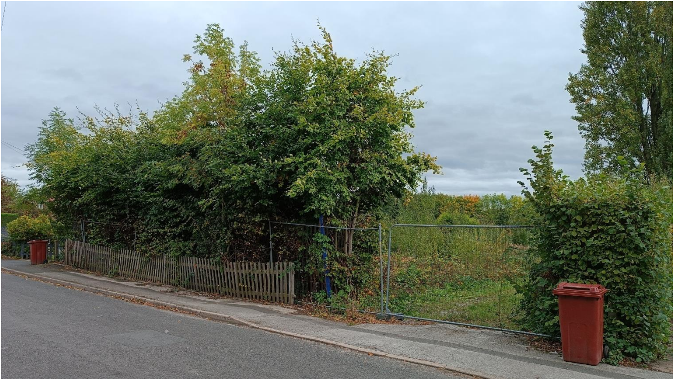
SITE OF FORMER 35 RED LANE WHERE VEHICULAR ACCESS IS PROPOSED.