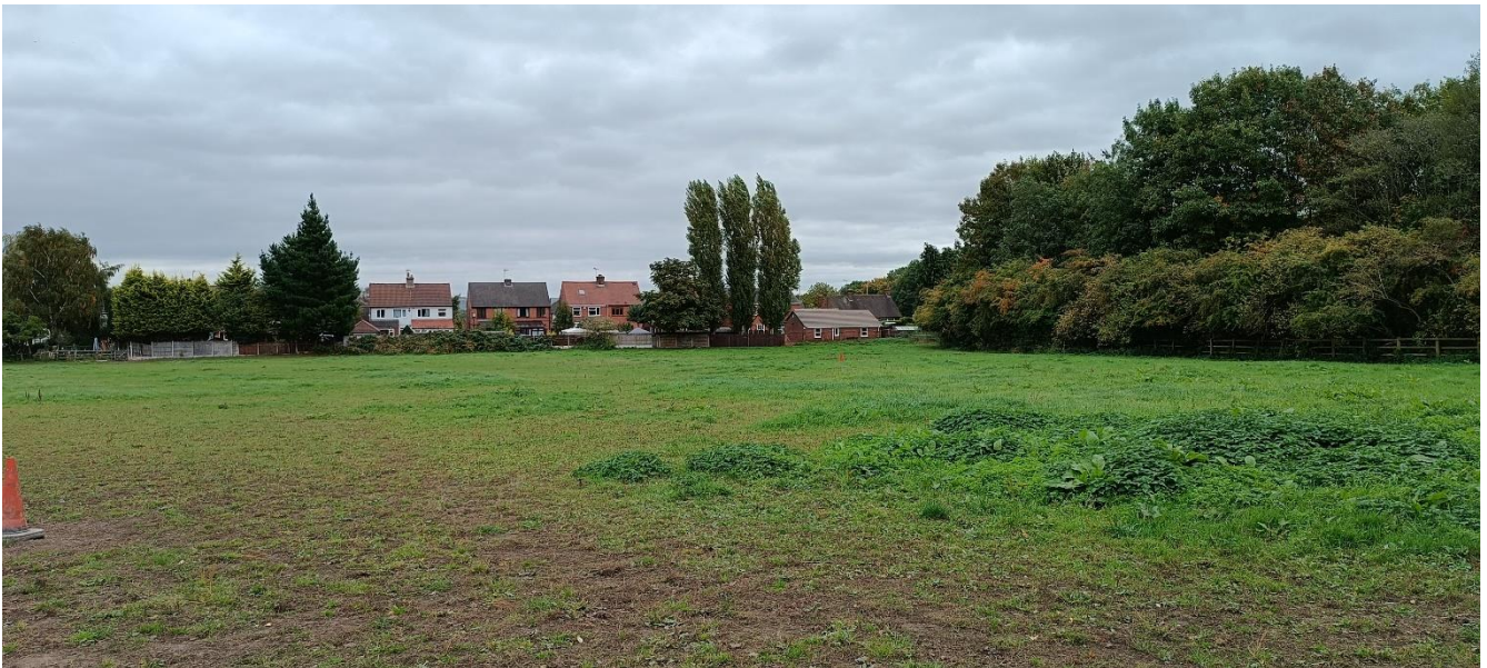
VIEW FROM POINT WHERE PUBLIC FOOTPATH ENTERS MAIN SITE LOOKING SOUTHEAST AND SHOWING REAR OF DWELLINGS FRONTING BIRCHWOOD LANE TO THE LEFT AND TREES ALONGSIDE A38 TO THE RIGHT.