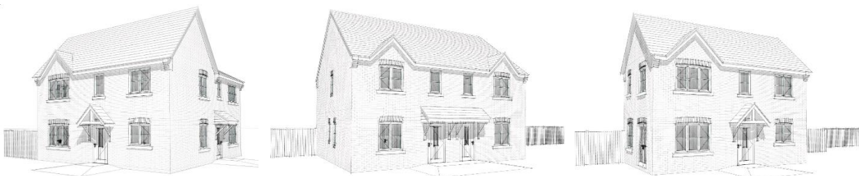
EXAMPLE HOUSE TYPES

Access to the site is proposed from where 35 Red Lane once stood (now demolished).