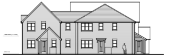
ELEVATION TO THE EAST