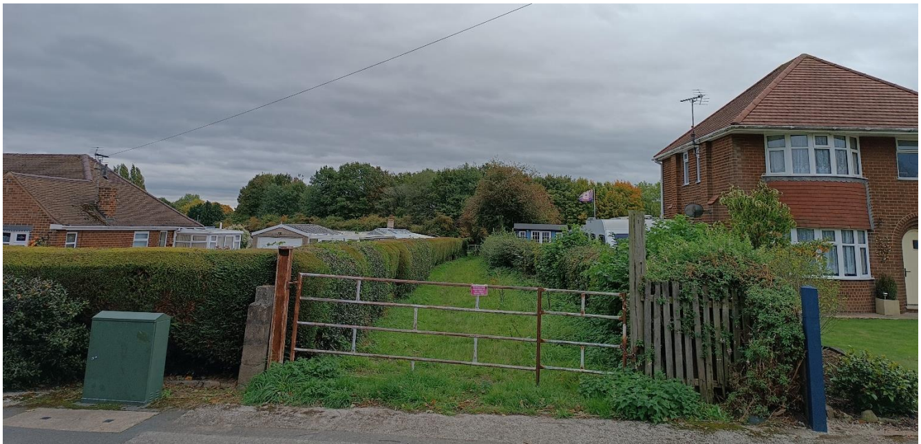
PUBLIC FOOTPATH LEADING INTO THE SITE FROM RED LANE.