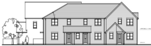
ELEVATION TO THE NORTH (ALONG PROPOSED ACCESS ROAD)