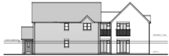
ELEVATION TO THE WEST (VIEW FROM ROAD)